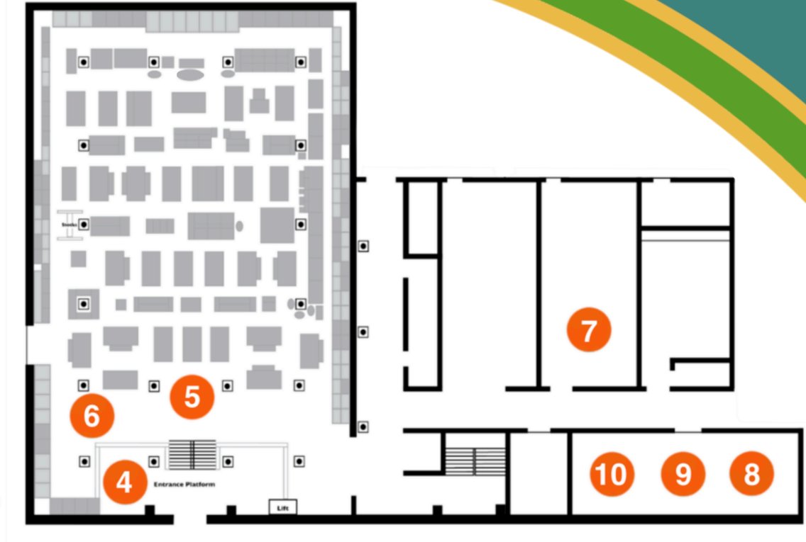
Pitt Rivers Museum Ground Floor