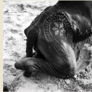
Camel decoration, Rajasthan, India.

Camel is a story of connection, survival and interdependence on the edges of our world. From the dry heat of the Sahara to the bitter cold of the Mongolian steppe, camels are at the heart of pastoral communities in some of the harshest desert environments on the planet. From prized possession to food source, they are a cultural linch-pin. Herdsmen, shepherds and sheikhs alike depend on their animals for livelihood, companionship and status.