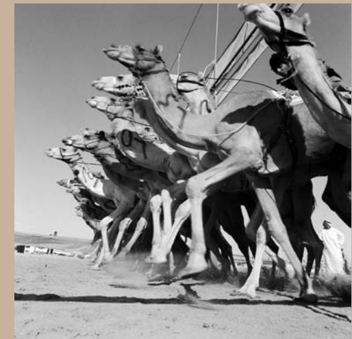
Camel race, Abu Dhabi, United Arab Emirates.