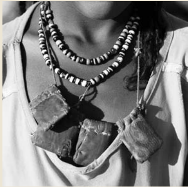
Koran on girl, North Kordufan, Sudan.

Camel is a story of connection, survival and interdependence on the edges of our world. From the dry heat of the Sahara to the bitter cold of the Mongolian steppe, camels are at the heart of pastoral communities in some of the harshest desert environments on the planet. From prized possession to food source, they are a cultural linch-pin. Herdsmen, shepherds and sheikhs alike depend on their animals for livelihood, companionship and status.