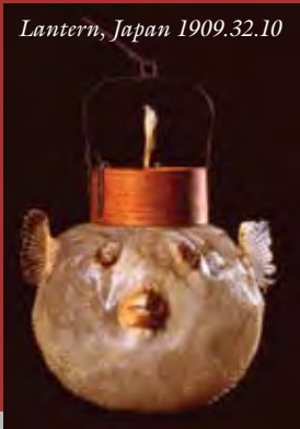
Lantern, Japan 1909.32.10