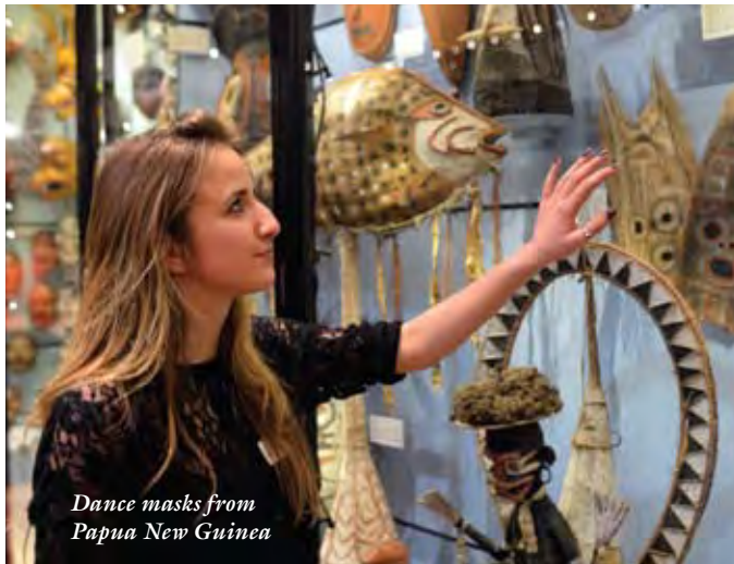
Dance masks from Papua New Guinea

If you are a UK tax payer, your subscriptions and donations are eligible for Gift Aid. Please sign the declaration on the application form. The Friends can then reclaim the tax. Additional donations are, of course, always very welcome.