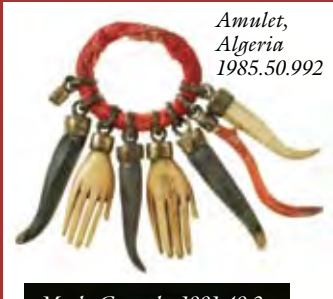
Amulet, Algeria 1985.50.992

The Pitt Rivers Museum is one of the world's great ethnographic collections. It is an Aladdin's cave of treasures, a rich and diverse mix of worldwide cultures and crafts, prehistoric and modern.