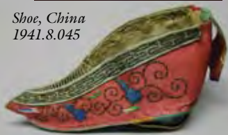
Shoe, China 1941.8.045