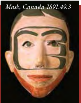
Mask, Canada 1891.49.3