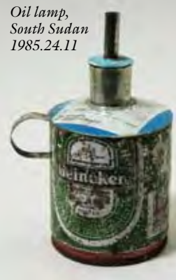
Oil lamp, South Sudan 1985.24.11