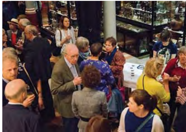
A Friends' reception in the Museum

By joining the Friends you can help this remarkable museum to flourish and grow. As a group of volunteers, the Friends appreciate members' help with administration, fund-raising and special events.