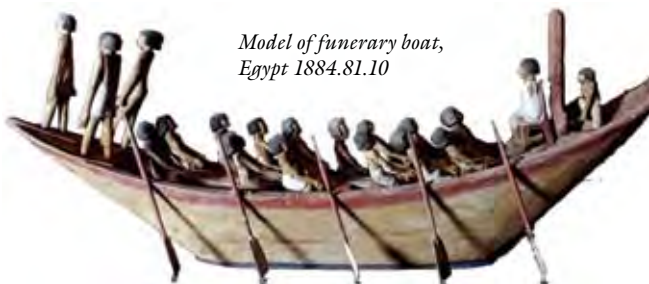
Model of funerary boat, Egypt 1884.81.10

The Friends support projects for which there is no funding, or for which top-up funds are needed. Over the years they have helped to purchase display cases, objects, and collections. PRM Friends gave £15,000 towards 'Light Fantastic', the Museum's lighting-improvement project, in 2013 and £15,000 towards the cost of a new display case for the Cook-voyage Collection in 2014. The Friends' Kenneth Kirkwood Memorial Fund provides bursaries to Museum staff for travel and research.