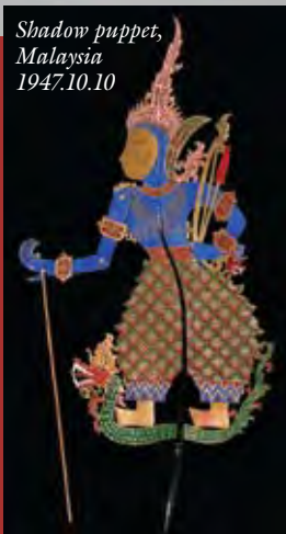
Shadow puppet, Malaysia 1947.10.10