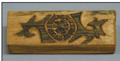
Block, Borneo, 1923.86.348

The small pattern to the left was tattooed on the wrist. The tattoo block represents an antique bead that was once worn by Kayan people as a protective charm. When a Kayan person was ill it was thought that his soul left his body and only returned when he was well again. After illness, to prevent their soul escaping for a second time, people tied a special bead called a lukut to one of their wrists. However, the string could break and the bead be lost so people began to tattoo this representation of the bead on their wrists instead. After some time the bead and the tattoo also came to be regarded as a charm to ward off disease.