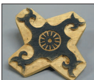
Block, Borneo, 1923.86.422

Tattooing has also been a common custom on the island of Borneo. The wooden pattern blocks, pictured below, were smeared with black ink and then pressed upon the skin to provide the tattooist with a template to follow. Such pattern blocks were always carved by men. However, it was the women who were considered experts on the significance and quality of the tattoo designs. Tattooing was only ever performed by them.