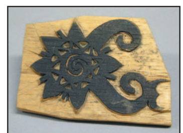
Block, Borneo, 1923.86.402

The designs pictured here are based on the image of a dog. The dog was highly regarded by the Kayan people and featured prominently in Kayan art. These patterns were tattooed on the forearm and thigh.