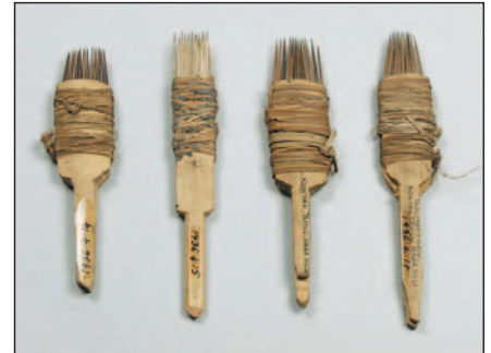
Tattooing tools, Nagaland, 1936.4.14 - .17

These tattooing tools are from Nagaland, a region in north-east India. Naga people used tattoos to indicate status just as other people might use ornaments or textiles.