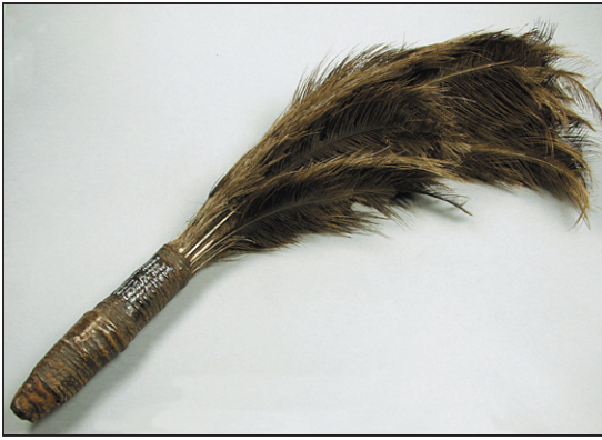
Fly whisk, Sudan, 1928.67.2