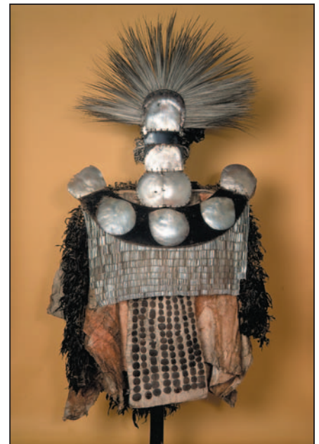
Mourning Dress, Tahiti PRM 1886.1.1637

Mahine was a high-ranking individual from the Society Islands who travelled with the voyagers. He appreciated that the value in Tahiti of the red feathers acquired on Tonga was greater than anything from Europe. It was only when the voyagers had these red feathers to exchange that the Tahitians began to sell their ornate mourning dresses, like the one pictured here.