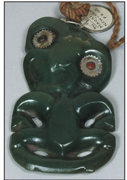
Hei tiki pendant, New Zealand, Pitt Rivers founding collection, 1884.77.6

It is generally believed that Pitt Rivers did not collect much material abroad. However, he did obtain objects whilst on active military service in Europe, Malta, and during the Crimean War. Later he collected objects during working trips and holidays abroad, but the vast majority of his collection came from dealers, auction houses, and from fellow members of the Anthropological Institute.