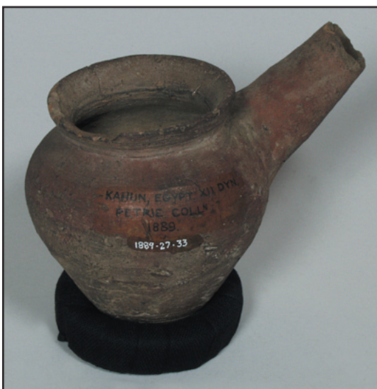
Jug excavated at Illatum, Egypt in 1889 by Flinders Petrie, Egyptian Middle Kingdom, 1889.27.33

More than 700 of the archaeological objects in the Museum were excavated by Flinders Petrie (1853-1942) and his team, who dug important ancient Egyptian sites, such as Hawara, Meydum, Abydos, and Amarna.