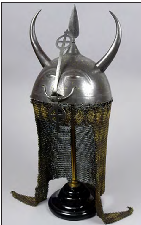
'Demon' helmet, Iran (Persia); 1966.1.1359

It is important to gain a psychological advantage in warfare. Armour and shields had fairly large surface areas that could be embellished with messages, symbols and decorations to encourage and inspire the wearer or intimidate his opponents. Bornean warriors would often adorn their shields with the hair of slain enemies. Some Indian shields were painted with hunting scenes to emphasise the role of the enemy as the doomed prey. In western New Guinea, a man went into battle to avenge the death of a relative, his shield would bear threatening, masculine motifs and depictions of the dead relative, thus making his enemies feel that they were fighting two men at once.