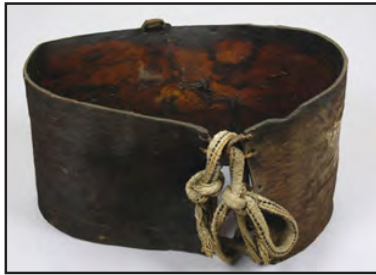
Buffalo-hide cuirass, Sema Naga people, Assam, India; 1923.85.545

Conversely, it could be argued that the greater mobility and sensory awareness provided by lighter and more flexible armour was worth the increased vulnerability. Bark belts and carved wooden shields were all the defence employed by the warriors of the Papuan Gulf. Similarly, this buffalo-hide cuirass from India was unrestricting; it covered the soft belly and vital organs but offered no protection to the chest, shoulders or neck.