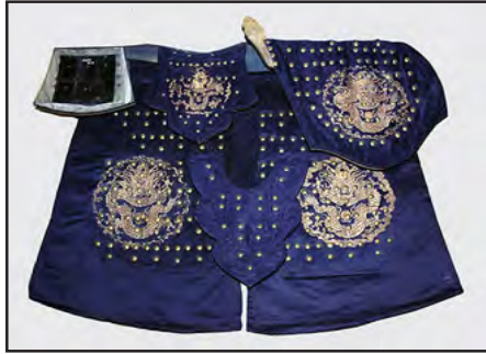
Brigandine armour, China, early 19th century; 1884.31.27

Some armours were thick and protected large parts of the body, although they were so heavy that the wearer could not run very far or fast. An example of this is brigandine armour, which consisted of large plates riveted to the underside of a thick garment.