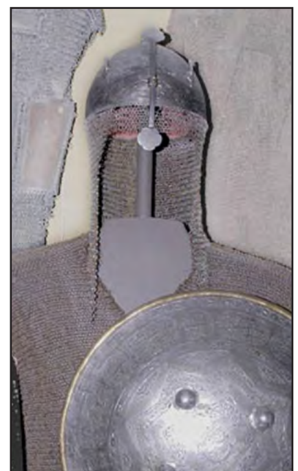
Mail shirt, helmet and shield, Georgia, the Caucasus, Russia; 1911.29.1, .2 and .4

Shields and armour were used in combination in many cultures. However, the rapid advancement of firearms from the 15th century, and the mounting cost of equipping large armies, gradually rendered shields and then armour obsolete. However, this decline did not happen everywhere at once. The Persian-inspired model of mail shirt, domed helmet and round, incised metal shield was used in the Caucasus area of Russia until two hundred years ago. Right up until the early 20th century there have been examples of the peoples of Africa, Oceania and the Americas attempting to resist gun-using Europeans with traditional armour and shields, usually with fatal results.