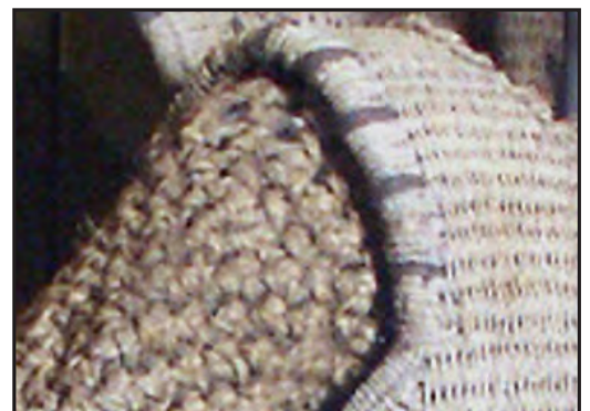
Detail of coconut-fibre armour, Kiribati, Micronesia; 1941.2.74.

A widely used deflective armour was mail, often called 'chain-mail', consisting of linked metal rings forming a rippling surface of miniature convex arcs. Weighing approximately 10kg, a mail shirt was not as heavy as full-plate armour, which offered greater protection against piercing. Yet plate armour too had its weaknesses – it could buckle or communicate the full force of a blow to the body, causing internal injuries. Other armours were designed to absorb impact. For example, padded fibres received and dissipated a blow, even though such 'soft' creations would not stand up to a high-velocity arrow or bullet. In Kiribati, Micronesia, entire suits were made of woven coconut-fibre to form a very tough matting.