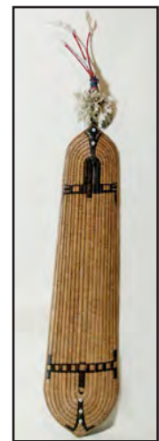
Basketry shield, Solomon Islands, Melanesia; 1895.22.196