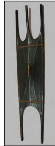
Pronged wooden shield, Igorot or Kalinga people, Philippines, South East Asia; 1929.71.2

The term 'defensive weapon' is something of a misnomer. Many weapons were multi-purpose and defence and attack often blurred in warfare. For example, some shields had pouches on the back in which to conceal daggers or pistols. Others were long and thin for bludgeoning or for parrying the blows of a club or sword. Some had sharp projections that could be used aggressively. This Philippine shield has three prongs on the upper edge to trip up an opponent. The two prongs on the lower edge would then be used to pin his neck to the ground so that his head could be cut off.